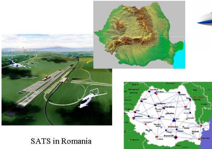
SATS in Romania